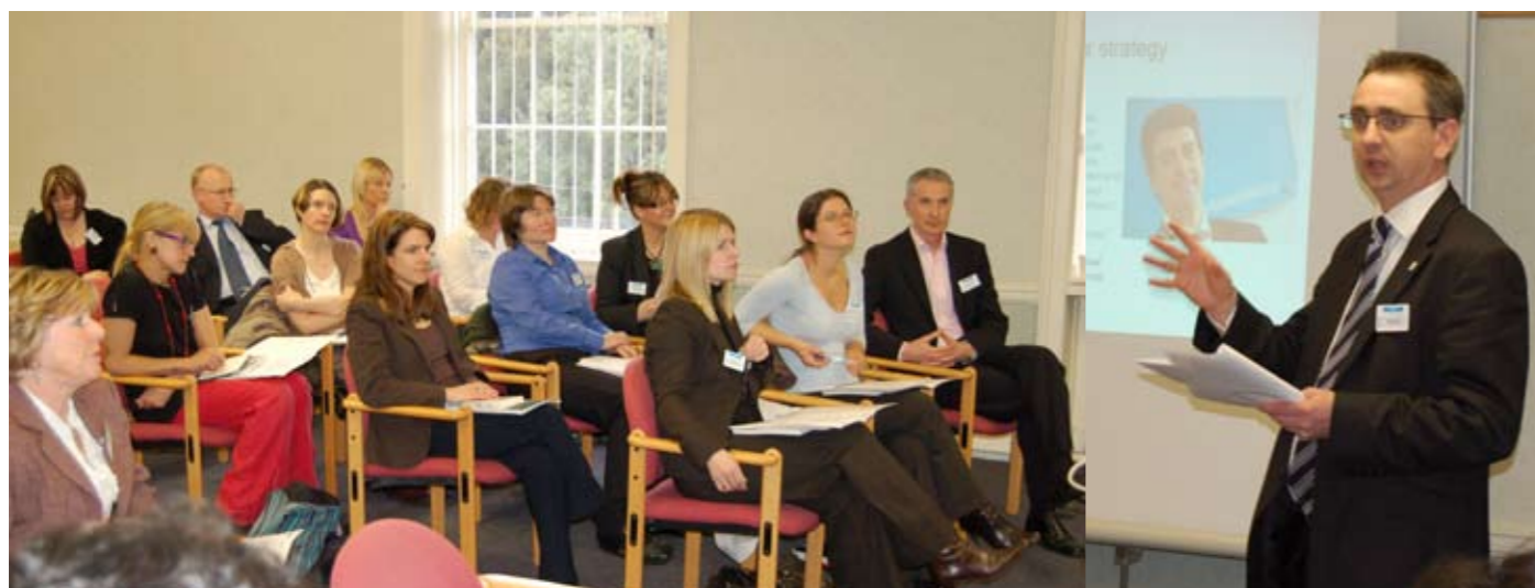
First session of the Opening Doors event held at Esholt (Yorkshire Water)