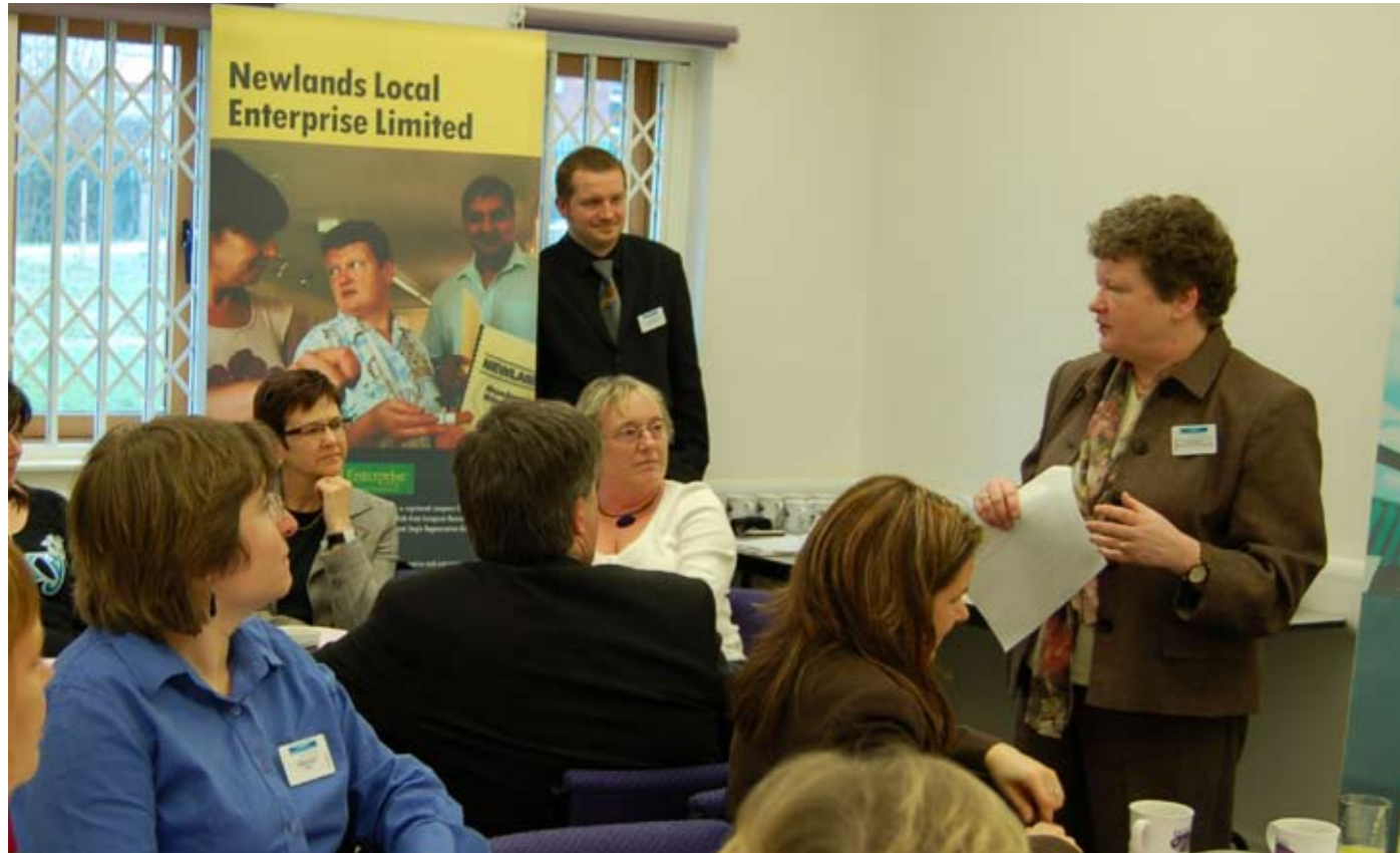
Opening Doors at the Gateway Centre

The programme now forms the basis of a proposed enterprise mentoring programme for Bradford District supported by the Local Enterprise Growth Initiative.