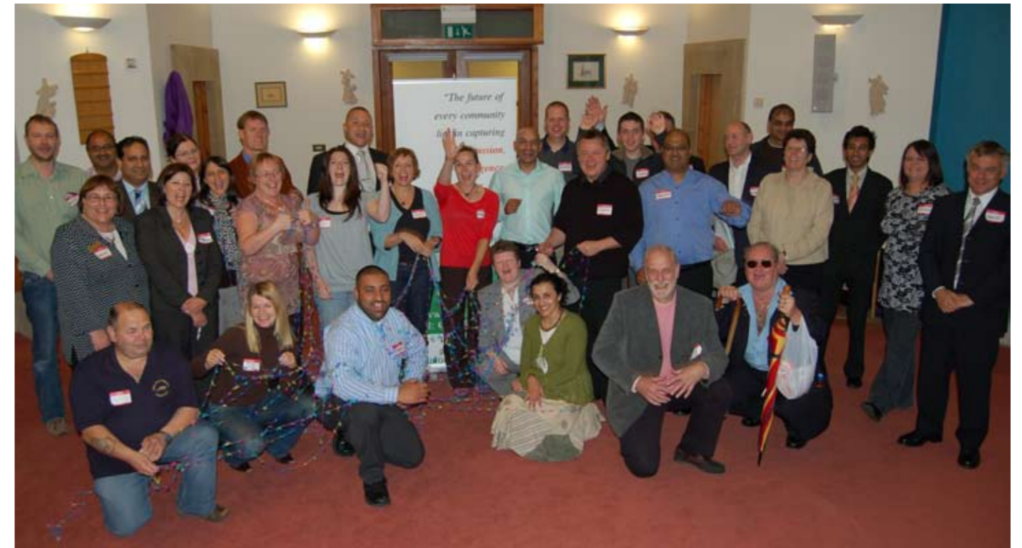
Inspired Futures launch 17th May 2007 at the Thornbury Centre

International Enterprise Facilitation Inc