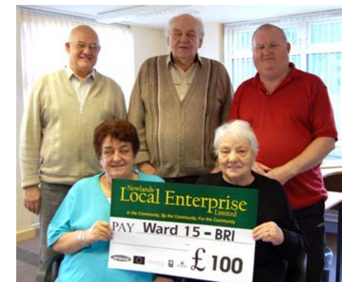
Newlands Enterprise directors donating £100 to Bradford Royal Infirmary

They came with a specific remit to develop the Admin & IT support services that we were providing to social and community enterprises in the area. The project was a huge success and very well received. The success of this project launched us into winning a contract with Bradford Chamber of Commerce as an Approved Supplier for the LEGI Professional Services, providing Admin & IT services to new and growing businesses.