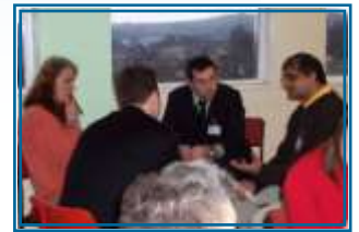
Ravenscliffe Community Association, Yorkshire Water & Newlands Local Enterprise