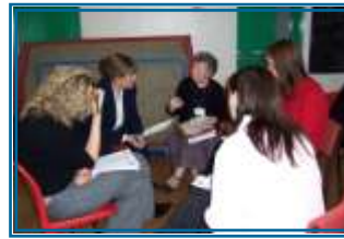
Newlands Holiday Club, Homestart, Yorkshire Water & Springfield Centre