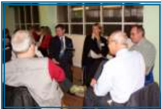
M.A.C.C., Fagley Youth & Community Centre, Yorkshire Water & Bradford Vision