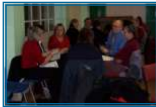
SNOOP, The Thornbury Centre, Yorkshire Water & Rockwell Nursery