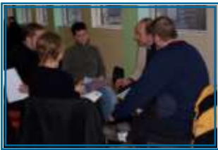
The Living Well, St Johns Centre—Fagley, Yorkshire Water & Bradford Business Broker